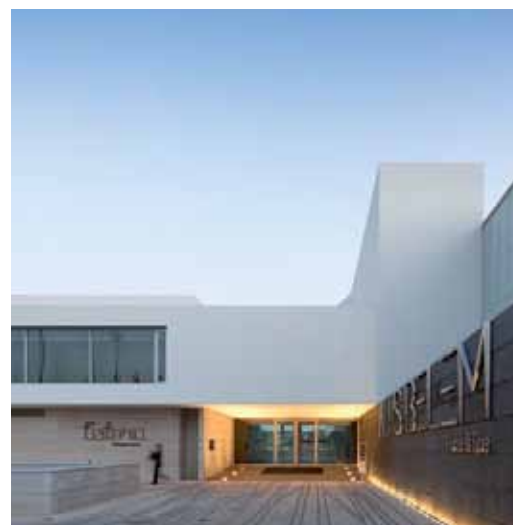
Hotel Altis Belém, Belém

Please note that all bank charges involved in bank transfer actions is to be covered by the delegate.