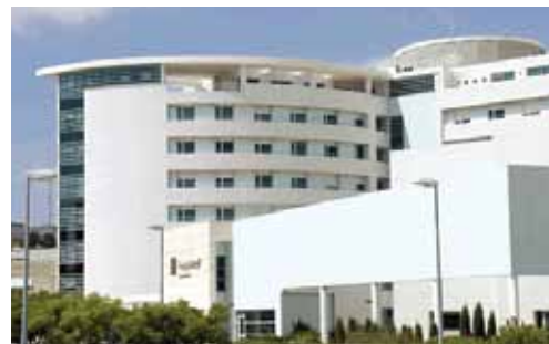
Hospital Cuf das Descobertas

This is a University hospital for nursing, medicine and technical learning, dating from 1987. It has 337 beds and 5 OR theatres. The surgical specialities include general, plastic, neurology, trauma, ophthalmology, ENT, orthopaedic and urology.