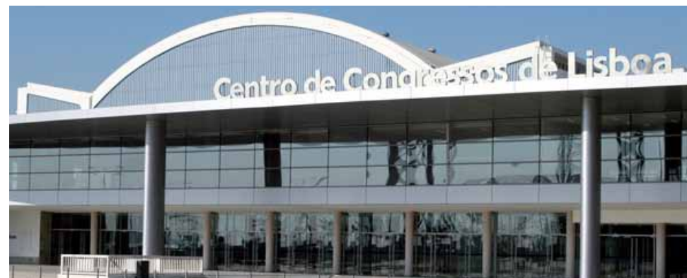
Lisboa Congress Centre

Get out at stop: Rua da Junqueira/ Congress Centre located just behind the CCL (8 stops after Cais do Sodré).