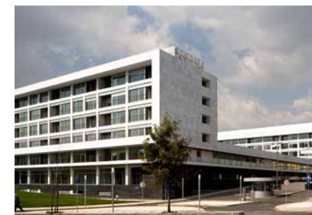
Hospital da Luz, Lisboa