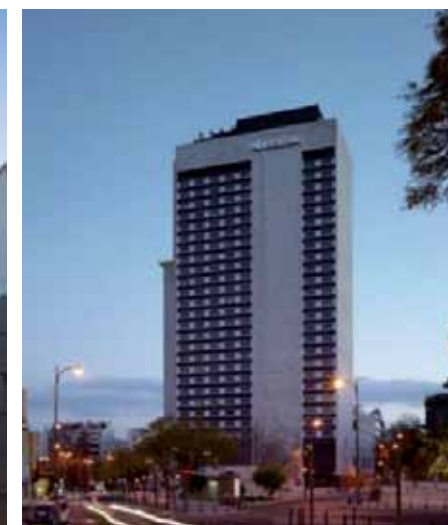
Hotel Sheraton, Lisboa