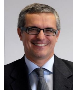
Director for health systems, medical products and innovation, Director General DG Sante, European Commission